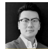
COOLIO YANG KANTAR, CHINA

With influencers increasingly becoming business as usual for brand communications, the risks that come with influencer marketing are now becoming apparent: inappropriate endorsements, lack of transparency and fake followers all damage the credibility of the influencers and the brands that use them, not to mention the trust of their followers. There may be risks, but there are also big opportunities for influencer marketing to prove its worth in 2020.